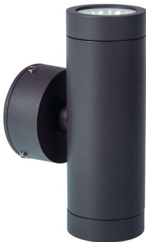
KSR1321 – Selva Up & Down